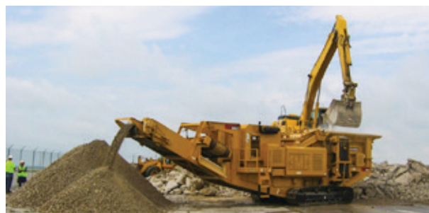
Crushing machine being loaded with construction debris by an excavator

Respiratory protection is not required for crusher operators regardless of task duration.