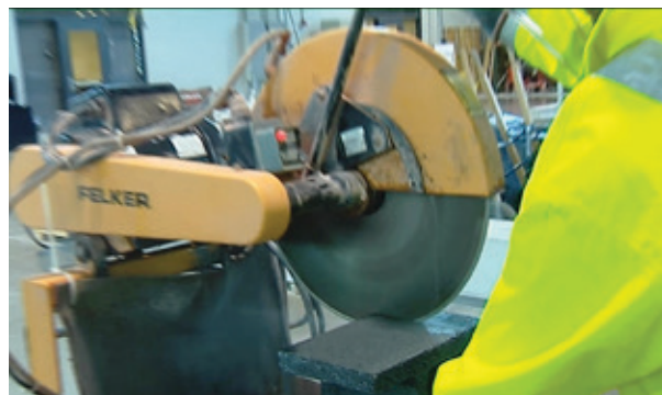
Worker cutting masonry block on a stationary masonry saw equipped with integrated water delivery system that continuously feeds water to the blade. Note water supply hose attached to top of shroud around blade.

Respiratory protection is not required for work with stationary masonry saws regardless of task duration.